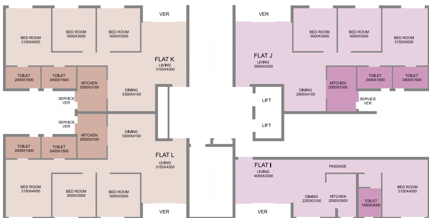
5TH FLOOR PLAN FOR TOWER 09, 15, 21, 26