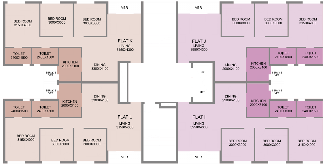
TYPICAL FLOOR PLAN FOR TOWER 09, 15, 21, 26