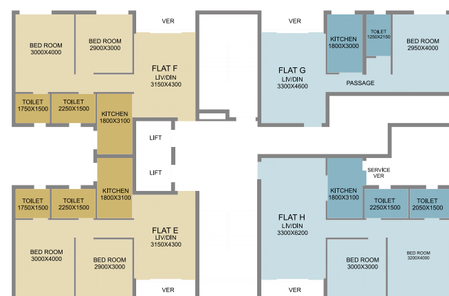
5TH FLOOR PLAN FOR TOWER 01, 03, 04, 06, 07, 10, 12, 13, 17, 18, 20, 23, 24