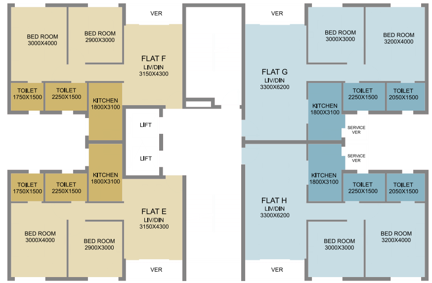
TYPICAL FLOOR PLAN FOR TOWER 01, 03, 04, 06, 07, 10, 12, 13, 17, 18, 20, 23, 24